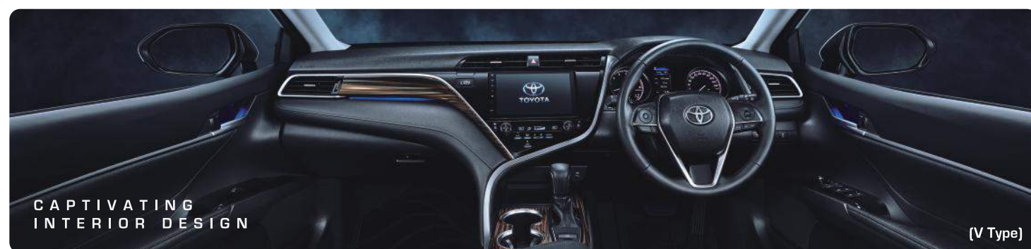
CAPTIVATING INTERIOR DESIGN