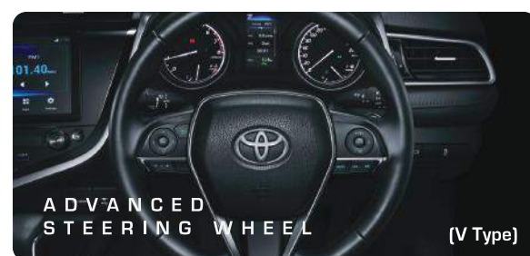
ADVANCED STEERING WHEEL