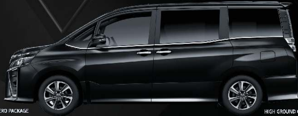
AWE-INSPIRING BELT LINE

Specially designed to feast your eyes, equipped with elegant aero package.