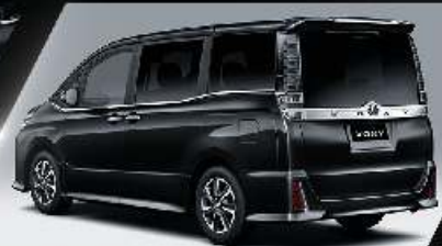
MAJESTIC REAR DESIGN