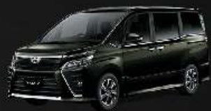
INAZUMA SPARKLING BLACK

Color options in the brochure might slightly be different from the actual color of the cars.