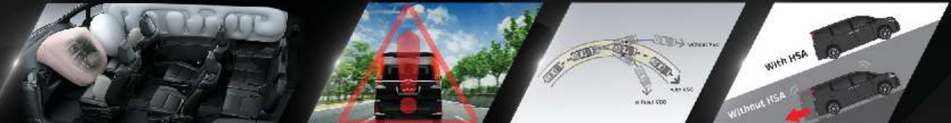
COMPLETE 7 SRS AIRBAGS

Equipped with complete safety features for maximum protection.