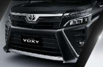
CUTTING EDGE FRONT DESIGN

Crafted with an awe-inspiring belt line that enhance every parts with a new level of luxury.