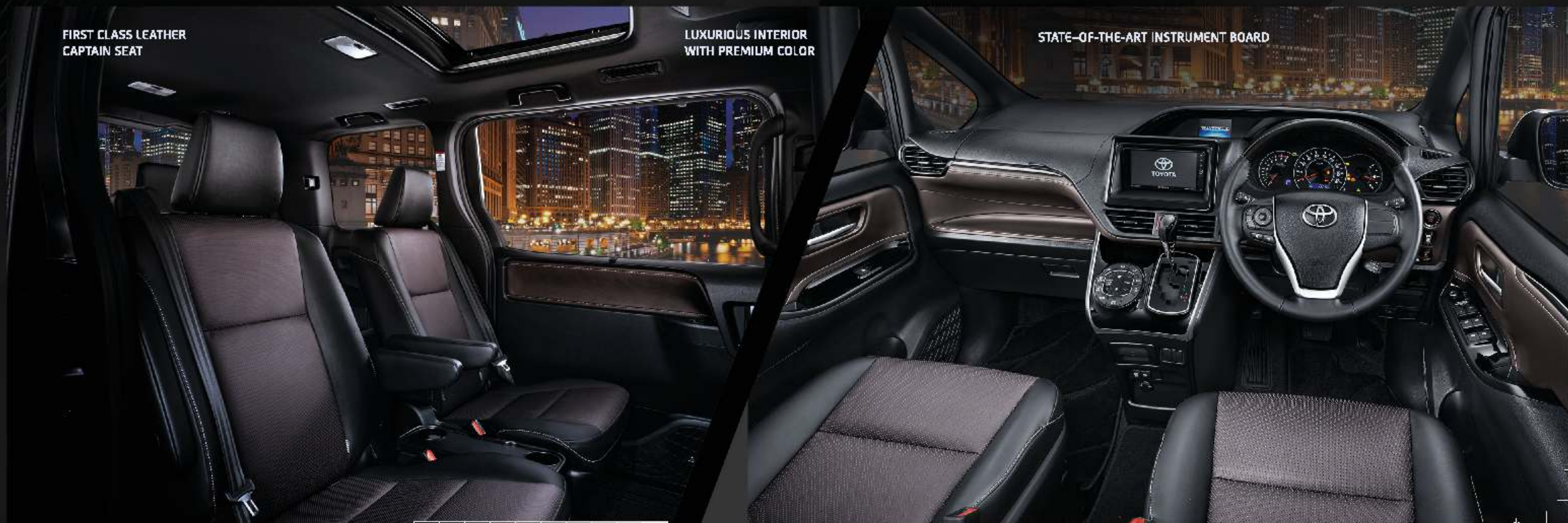
STATE-OF-THE-ART INSTRUMENT BOARD