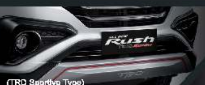
(TRD Sportivo Type)

TOUGH FRONT TRD UNDERGUARD Take on the road with solid strength and dominating appeal.