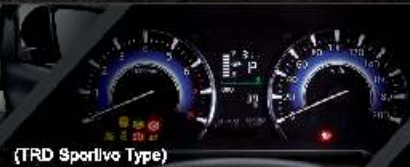
(TRD Sportivo Type)

DISTINCTIVE SOFT TOUCH DASHBOARD Dynamic two-tone aesthetic with premium modern design.