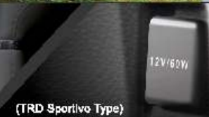
(TRD Sportivo Type)

AUTO A/C WITH DIGITAL DISPLAY Precision-controlled air flow to cruise in perfect comfort.