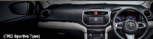
(TRD Sportivo Type)

DISTINCTIVE SOFT TOUCH DASHBOARD Dynamic two-tone aesthetic with premium modern design.