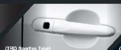
(TRD Sportivo Type)

TOUGH FRONT TRD UNDERGUARD Take on the road with solid strength and dominating appeal.