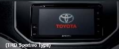
(TRD Sportivo Type)

BOLD 16" MACHINING ALLOY WHEEL Innovative design with attitude.