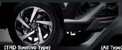
(TRD Sportivo Type)

BOLD 17" MACHINING ALLOY WHEEL Innovative design with attitude.