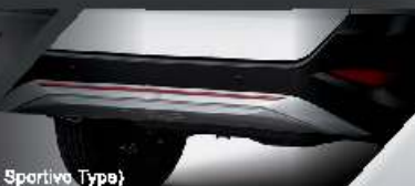
(TRD Sportivo Type)

STRIKING SIDE MouldING Bold impression for a captivating side exterior.