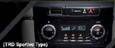
(TRD Sportivo Type)

STUNNING COMBINATION METER Visually attractive and informative display panel.