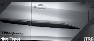
(TRD Sportivo Type)

ADVANCED TECH LED HEADLAMP Strong presence with state-of-the-art line guide LED.