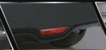
REAR FOG LAMP