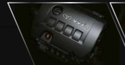
2ZR-FBE 1.8L DELIVERS EXCELLENT BALANCE OF POWER AND FUEL EFFICIENCY.