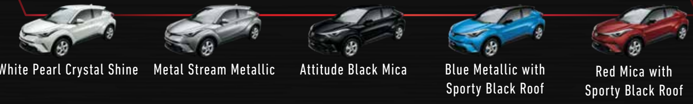
White Pearl Crystal Shine Metal Stream Metallic Attitude Black Mica Blue Metallic with Sporty Black Roof Red Mica with Sporty Black Roof