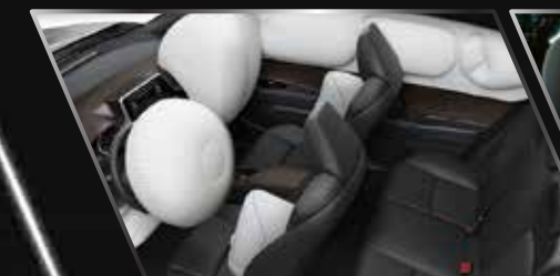
7 SRS AIRBAGS (DRIVER + PASSENGER 2 SIDE AIRBAGS; 2 CURTAIN SIDE AIRBAGS, & DRIVER KNEE)