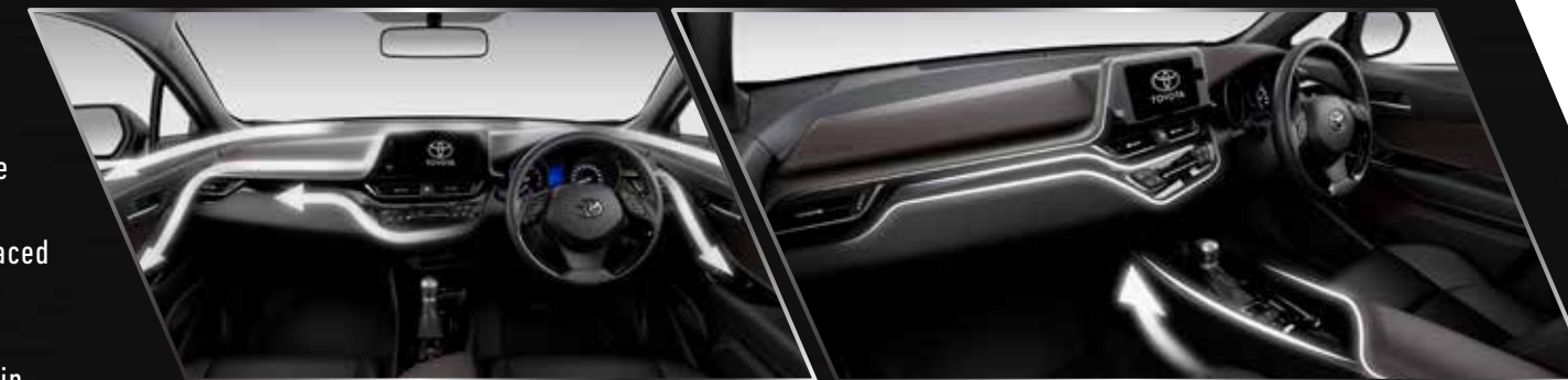
THE BLACK AND BROWN INTERIOR WITH WELL CRAFTED DETAILS AND TEXTURES CREATES A CALM AND COOL ATMOSPHERE.

Experience the stylish and stimulating atmosphere with driver oriented functionality. Combination meters and displays have been placed along the driver's line of sight and controls have been strategically positioned to match the operation sequences. So, once you get in, you're instantly surrounded by a space that's been designed for someone who is really passionate about driving.