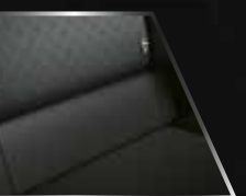
ISOFIX CHILD RESTRAINT SYSTEM