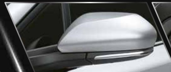
OUTER MIRROR WITH SIDE TURN SIGNAL LAMP