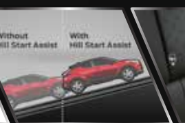
HILL START ASSIST CONTROL