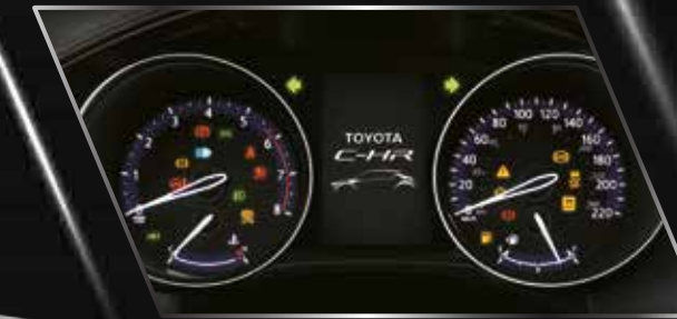
TFT TYPE MID-OPTITRON METER WITH 4.2-INCH COLOR MULTI-INFORMATION DISPLAY