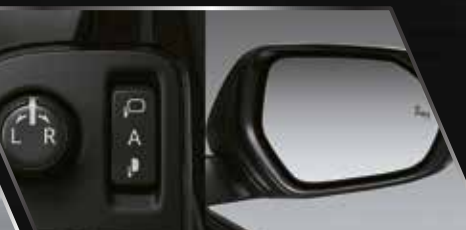
ELECTRICALLY RETRACTABLE OUTER MIRROR