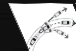
VEHICLE STABILITY CONTROL (VSC)