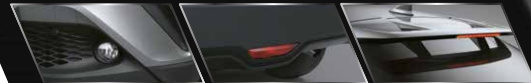
FRONT FOG LAMP & DRIVING LAMP

The new Toyota C-HR carries state-of-the-art safety technology with advance safety features and that are designed to help keep you alert and safe in the event of an accident.