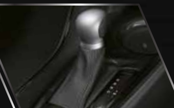
7-SPEED CVT SEQUENTIAL SHIFTMATIC ENSURES A HIGH LEVEL OF DRIVABILITY, SMOOTHNESS, QUIETNESS, AND FUEL ECONOMY.