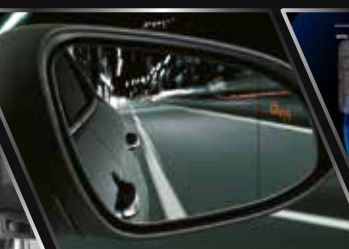
BLIND SPOT MONITOR SYSTEM